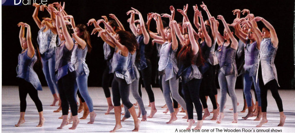
A scene from one of The Wooden Floor's annual shows